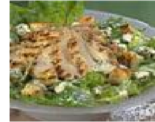
Chicken Caesar Salad

Serves 8-10 (S) 16-20(M) 26-30 (L) S $70 M $140 L $210