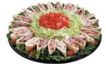
Gyro Platter with chips $65 $120 $195 Pick- A-Pita Platter $65 $120 $195