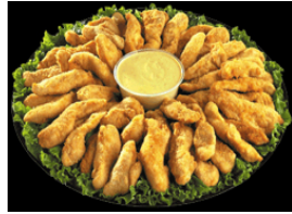
Chicken Tenders Platter $35 $45 $65