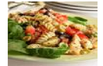
Fruit Salad Platter $40 $75 $110 Rotini Primavera Garden Salad $35 $55 $75